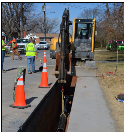
This trench along Barbee Street was quickly repaved in 2022.

Offsetting the shorter lifespan is the fact that there was less disutility. Residents got to keep more of their