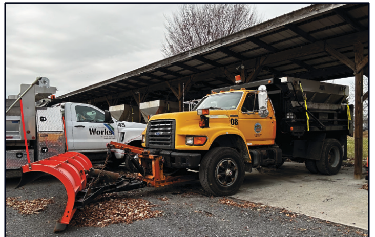
Our snowplows stand at the ready for this season's storms.

worry though! Our crew is still hard at work, but they will be spreading a single layer of salt and waiting for the chemicals to take effect. They will also be monitoring ground temperatures and weather conditions to better inform decisions about the need for additional salt. We might not get it right on the first try, but we are attempting to balance the need for safe roadways with the goal of protecting the environment, public health, and infrastructure by reducing the amount of salt used.