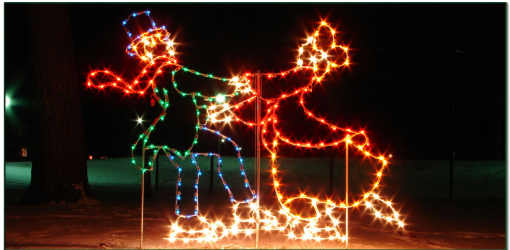
One of the displays that will transform Oakdale Park into Winter WonderLane this season.