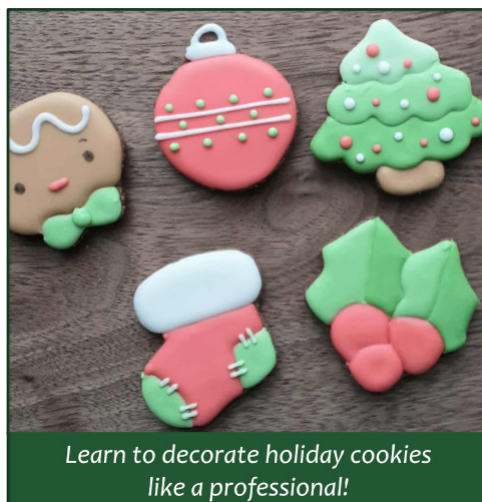
Learn to decorate holiday cookies like a professional!

Admission is free, and tickets are available on the day of the showing. Check www.sipecenter.com/movies in the coming weeks for showtimes.