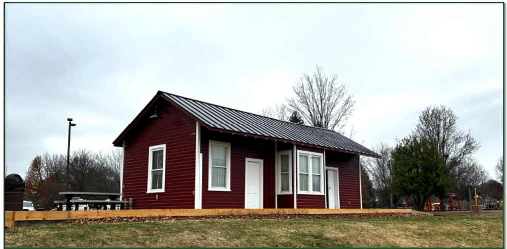
The depot at Oakdale Park boasts a fresh coat of paint and a new metal roof.

Give the gift of life by donating blood on December 9. Register at bridgewater.town/blooddrive .