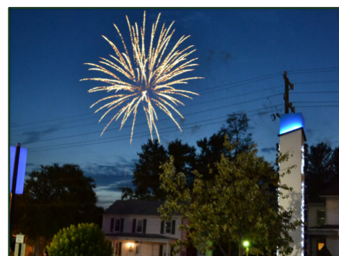
Generations Park is the place to enjoy live music and to watch the fireworks in celebration of the Eve of Independence.

Join us on Friday, July 3 for our Eve of Independence Celebration. Enjoy live music at Generations Park beginning at 7:30 pm performed by Everyday People, an 8-piece band that plays '60s and '70s soul, funk, and R&B. We'll have food trucks on site. Fireworks will light up the sky behind the Town Office starting at 9:25 pm. Bring your lawn chairs and blankets, and celebrate the spirit of Independence Day with family, friends, and neighbors!