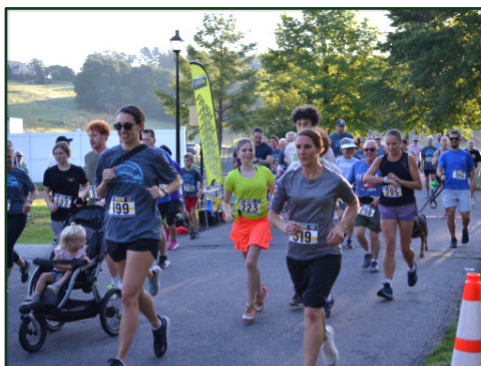
Start your Labor Day celebration with the Race to the Bottom 5K!

Register now for the Race to the Bottom 5K on Labor Day, September 7, starting at 8:00 am. Sign up by August 16 for the reduced rates of $25 for adults and $15 for children, and your t-shirt will be guaranteed. Proceeds benefit the American Cancer Society. We welcome participants of all ages and fitness levels. Walkers, strollers, and dogs are all welcome on the course.