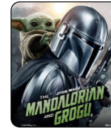
The Mandalorian & Grogu